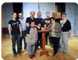
The cast and crew of “The Complete Works of William Shakespeare (abridged) (revised)”