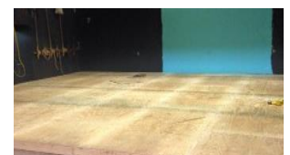
Photos from demolition of old to installation of new stage floor.