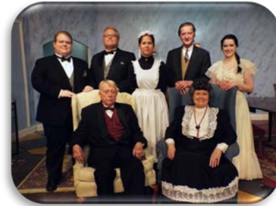
The cast of “An Inspector Calls”

“Break a Leg” to the cast and crew of An Inspector Calls that opened on January 16 and runs through February 1. The production just finished opening weekend, and had two more weeks of performances to go of this British drama by J. B. Priestly. Produced by special arrangement with Samuel French, Inc; this is the first show in Oyster Mill’s 2015 season. Special thanks to the cast and crew (listed below) for all of their help with the production: