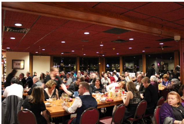
Oyster Mill members, patrons, actors and supporters enjoy the OMies Award festivities at Duke’s Riverside

The 5th annual OMies Awards ceremony was held at Duke’s Riverside on January 10, 2016. Over 85 people attended the gala celebration of the Oyster Mill Playhouse 2015 Season and cheered the award of OMie statuettes for Best Set, Best Costumes, Best Sound, Best Lighting, Best Actor, Best Actress, Best Play and Best Musical.